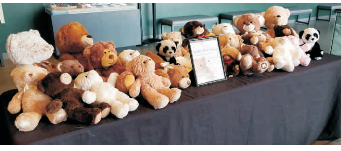
Class Project Teddy Bear Drive for Carl Perkins Center Over 250 Bears Collected