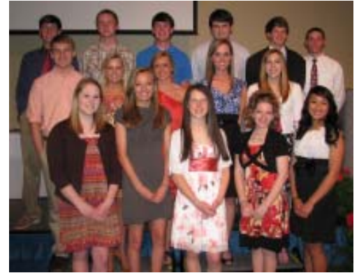
First State Youth Leadership