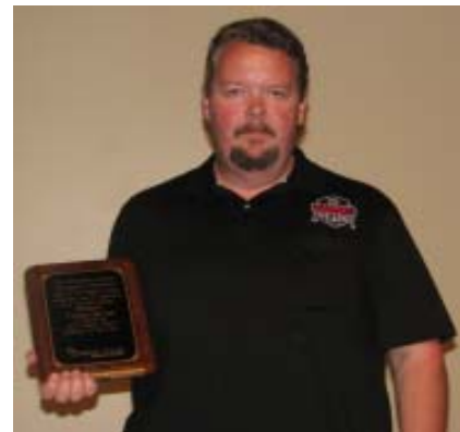
Business of the Year Harper's Wercker Service

The Annual Weakley County Chamber of Commerce's President's Banquet was held Tuesday, April 26, at the Boling University Center Ballroom. Present were over 300 Chamber members and guest honoring this year's outstanding citizen, business, and youth of Weakley County.