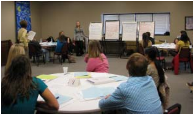
Leadership Training Day