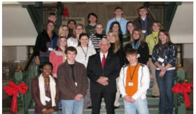
Local Government Day