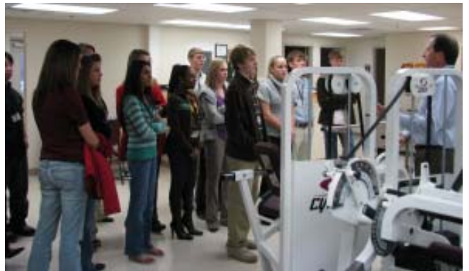
Quality of Life Day