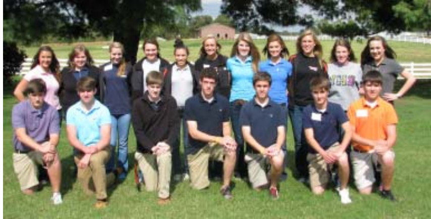
Team Building Day

First State Youth Leadership of Weakley County Board of Directors is pleased to announce the Class of 2012.