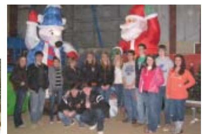
Class Project - Santa's Village