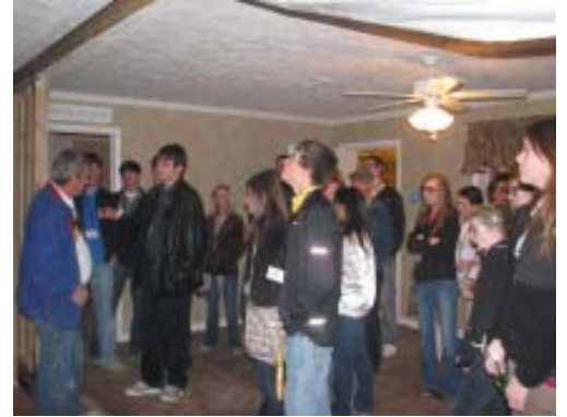
Economic Development Day